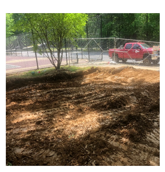
Backfill at Sanitary Tie-in