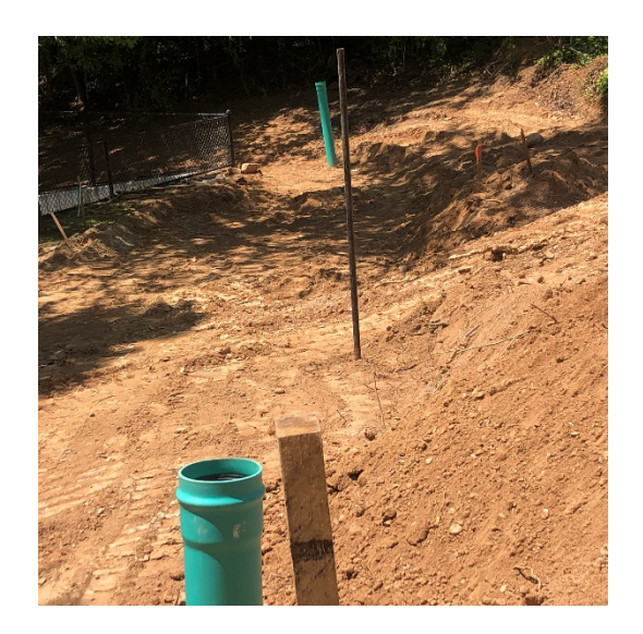
Sanitary Cleanout Install